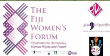
The Fiji Women's Forum and Fiji Young Women's Forum National Convention 28 th to 30 th August, 2017