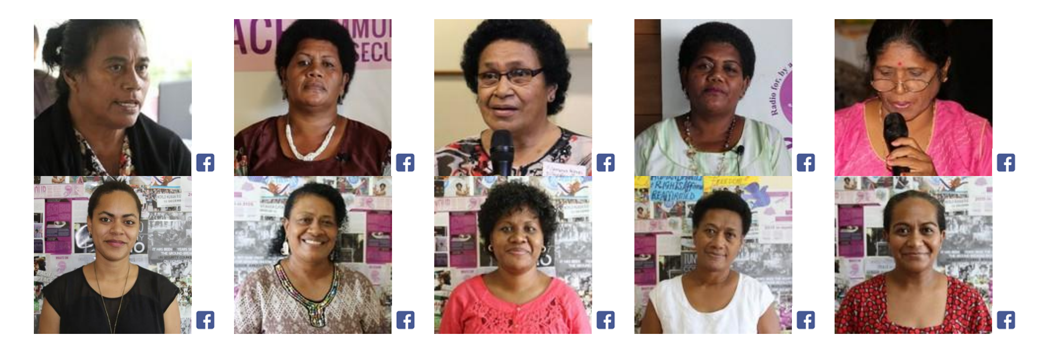
Visit our Here Are The Women section on our Website: <a href="http://www.femlinkpacific.org.fj/index.php/en/actions/here-are-the-women">http://www.femlinkpacific.org.fj/index.php/en/actions/here-are-the-women</a>