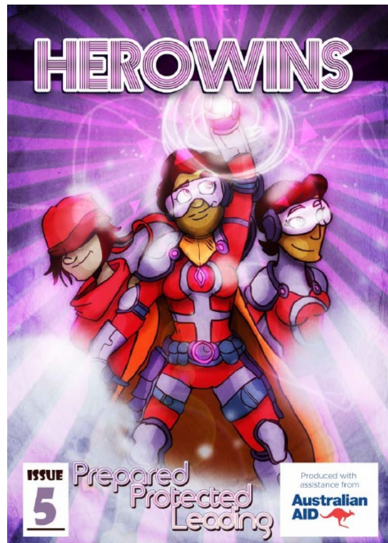
HEROWINS 5: Prepared, Protected, Leading

http://www.femlinkpacific.org.fj/index.php/en/actions/policy-documents/597-herowins-5-prepared-protected-leading (/index.php/en/actions/policy-documents/597-herowins-5-