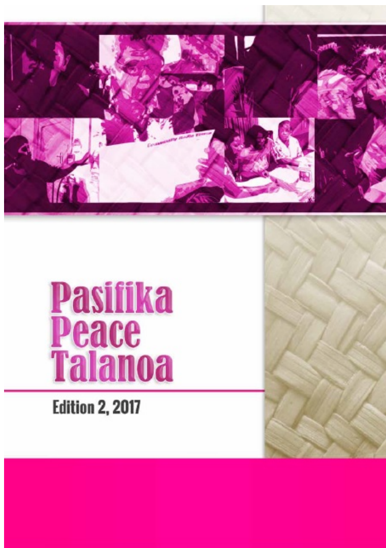
Pasifika Peace Talanoa 2/2017

http://www.femlinkpacific.org.fj/index.php/en/actions/policy-documents/596-pasifika-peace-talanoa-2-2017 (/index.php/en/actions/policy-documents/596-pasifika-peace-prepared-protected-leading-talanoa-2-2017)